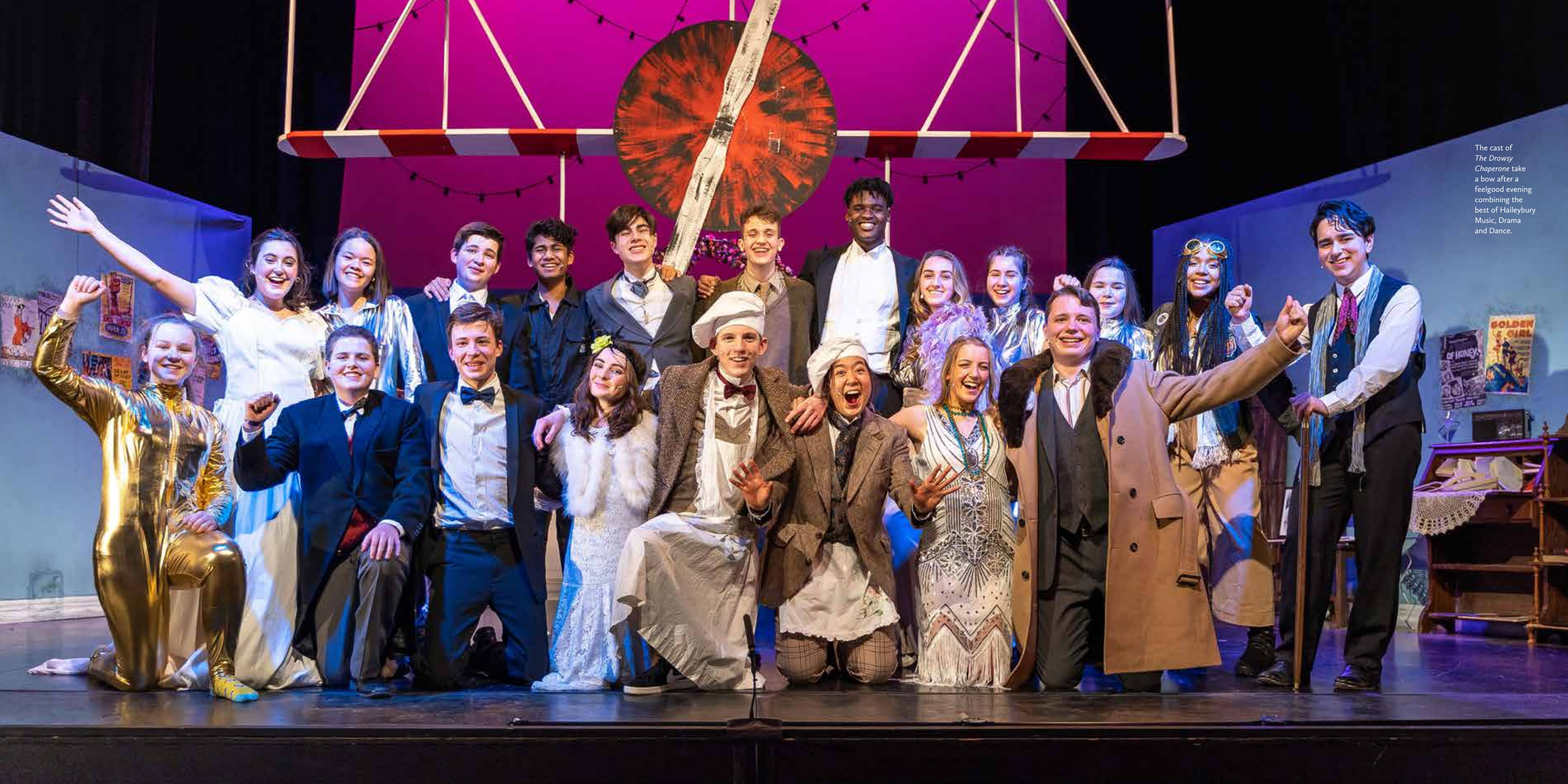
The cast of The Drowsy Chaperone take a bow after a feelgood evening combining the best of Haileybury Music, Drama and Dance.